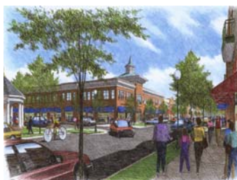
Versailles Center...is this where Woodford Countians will shop in the future?

Will the horse industry be fully recognized as an “industry without a roof” and will local governments undertake to plan and commit resources to the needs associated with this industry—including land resources. Also, can Woodford coordinate with its neighbors to ensure this industry is considered a “regional resource” requiring similar...policies between neighbors.