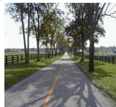
Old Frankfort Pike...a Regional Resource?

As noted throughout this section, the Plan makes almost no mention of regional cooperation or coordination within any of the stated goals and objectives. Not surprisingly then, there is no goal statement for regional planning.