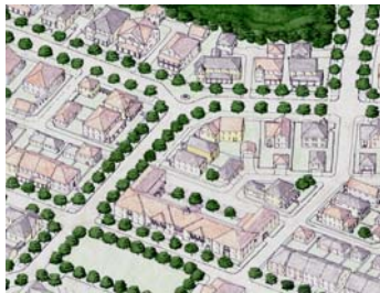
Who will live in Woodford's neighborhoods in the future and where will they work?